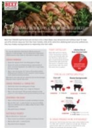
Today's Beef Choices Fact Sheet Qty _____