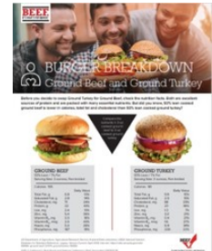
Burger Breakdown Comparison Qty _____