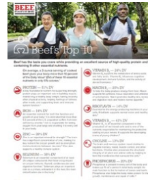
Beef Nutrient Lesson—learn the unique role each nutrient plays in the body Qty _____