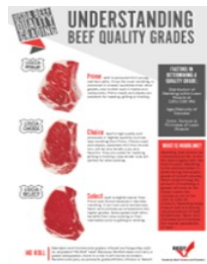
Understanding Beef Quality Grades Fact Sheet Qty _____