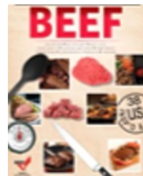
Basics of Beef Booklet (1 per classroom) Online version available Qty _____