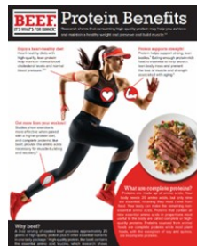
Protein Benefits Qty _____