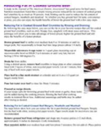
Reducing Fat in Ground Beef Tip Sheet Qty _____