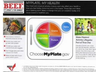
My Plate, My Health Fact Sheets Qty _____