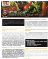
Surprising Facts About Beef Fact Sheet Qty _____