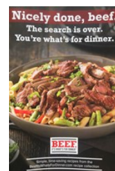
Beef Recipe Booklet Qty _____