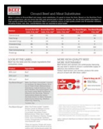
Ground Beef & Meat Substitutes Fact Sheet Qty _____